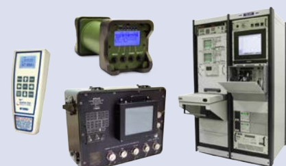
Multi-Level Test Systems, Electronic Components / Assemblies