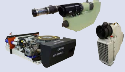
Ground & Maritime Primary / Secondary Support Systems